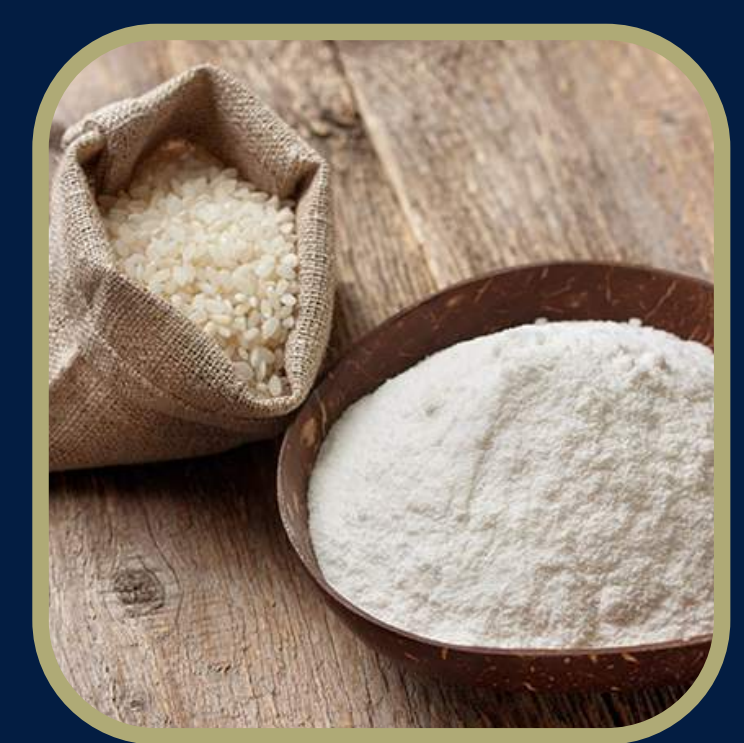
Glutinous Rice Flour